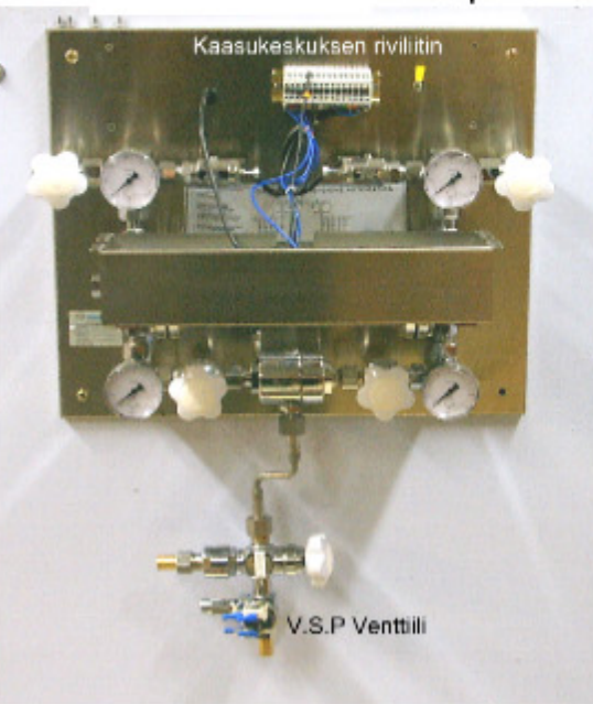
SCHEME OF THE INSTALLATION ALARM OF THE CENTRAL WITH DIGITAL ENTRIES. USE THE CONNECTION OF THE PICTURE WITHOUT REPEATING AND WITHOUT CONNECTION WITH THE CONTROL SYSTEM OF ALARM MEDICAL GAS